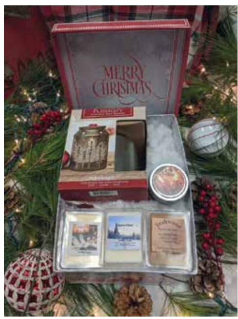
Holiday Wax Warmer Gift Box $35 Includes three wax melts, candle and wax warmer