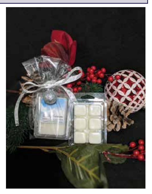
Wax Melts $3