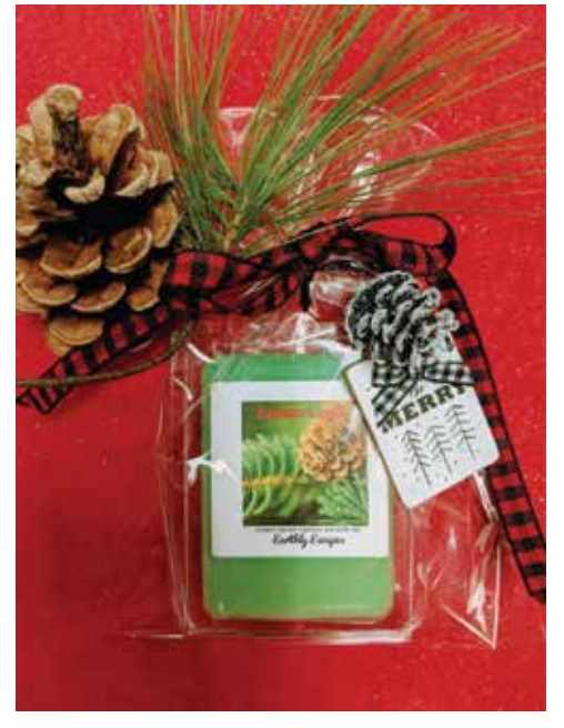
Wax Melts $3